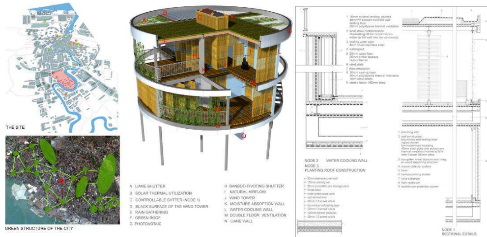
Figure 1 Analysis of nature and the appropriate technology

From point of physical environment, the basic function of a house is to satisfy the physical need. The site located near the equator, and the weather is hot, humid and rainy. The strong sunlight in the afternoon seems to roast the land melting. Shadow and natural ventilation are the most effective methods to keep cool and to create an environmentally-friendly community. So both healthy light environment and good airflow are the major aspects in technological green design.